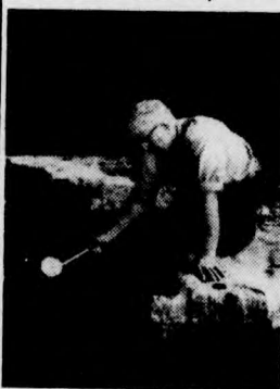
Our own iron-free water

AT THE JACK DANIEL DISTILLERY, we have everything we need to make our whiskey uncommonly smooth.