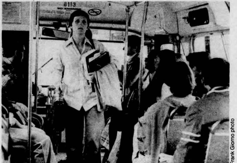
When (at last) the new Spadina extension of the subway is completed. York might finally get something approaching reasonable transit service.