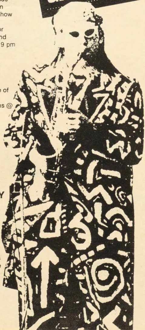
The Shuffle Demons