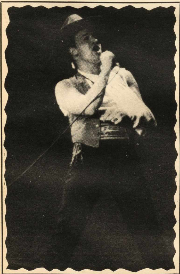
Bono: good thing his voice wasn't dislocated.