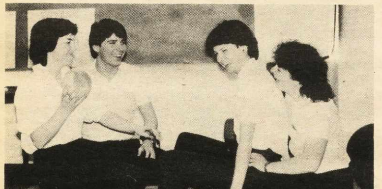
Students of Occupational Therapy have a rolling good time introducing their program to local high school students on March 14-15.

"When you send the major finance hatchet man into education, you've got to start worrying about what he's going to do."