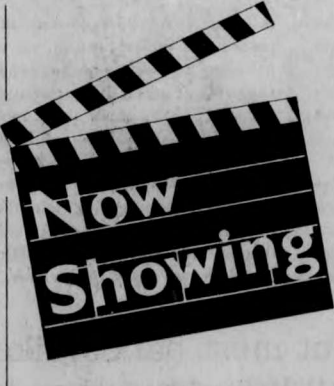
BEAVIS AND BUTTHEAD Do AMERICA

"Everyone always keeps telling us to keep doing it.. Our sound isn't excessively weird, so it can fit on the radio. It's just a question of finding