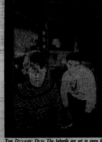
THE DYNAMIC DUO: The Inbreds are set to open for