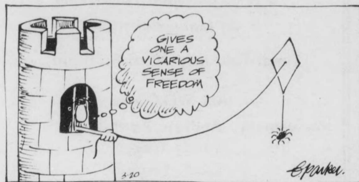
THE WIZARD OF ID by Brant parker and Johnny hart