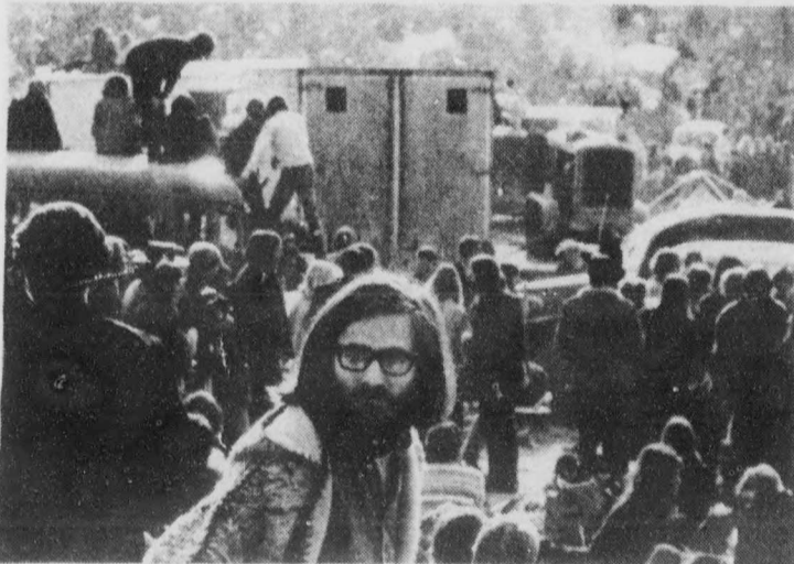
WOODSTOCK — THE GREATEST EVENT IN ROCK AND ROLL HISTORY