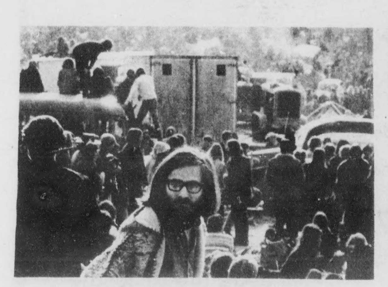
WOODSTOCK — THE GREATEST EVENT IN ROCK AND ROLL HISTORY