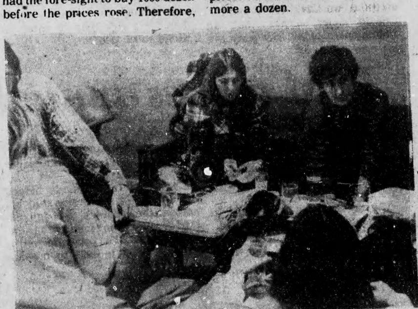
Students will soon have to pay more for their liquid refreshments at pubs and the social club.

OPEN MONDAY TO SATURDAY 7:30 a.m. to 10:30 p.m.