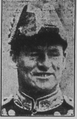
It is understood that Rear Admiral Evans, "Evans of the Broke" fame, is to succeed Vice Admiral H. J. Tweedie as Commander-in-Chief of the African Station of the British Navy. The popular Rear Admiral is pictured above.