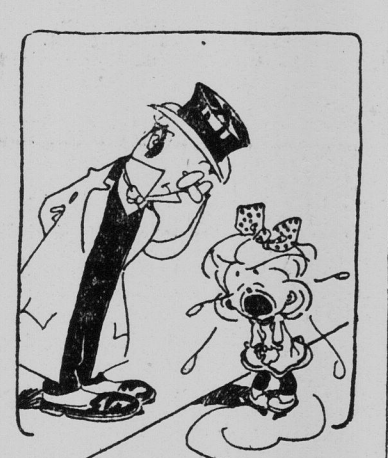
"And why criest, little one?" "Oh! sir, me brudder went and pinched e silk dress fur his best goil to wear to