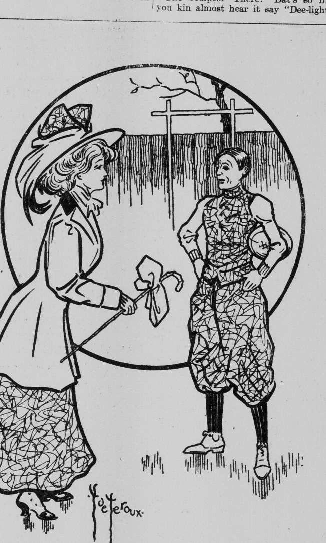
Evelyn-Now Harold, of course I want you to win the game, but please pro-