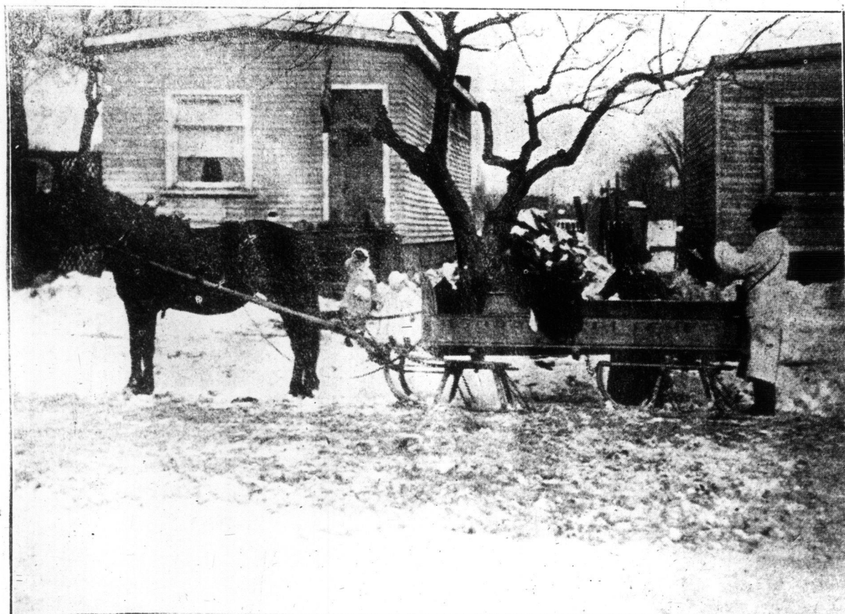
Bringing the butcher to the homestead. How the housewife gets her daily supply not far from the limits of Toronto.