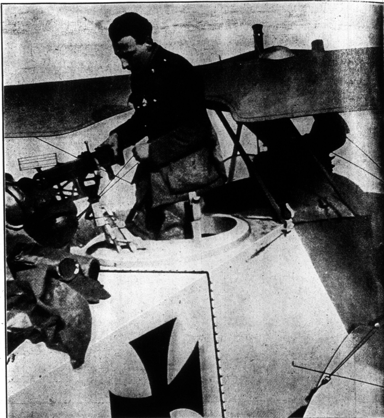
Inspecting his capture. British aviator by clever manoeuvring compels a German aviator to descend over the Allies' line, capturing the machine intact and taking the pilot and his observer prisoners. The photograph shows the victor inspecting the machine which differs in many respects from the new Fokker machine. The pilot sits under the planes in front of the observer. The observer, who is seated with his back to the pilot and in action, fires his gun over the stern of the aeroplane. If necessary, however, he can turn completely around and, transferring his gun to another bracket, fires sideways.