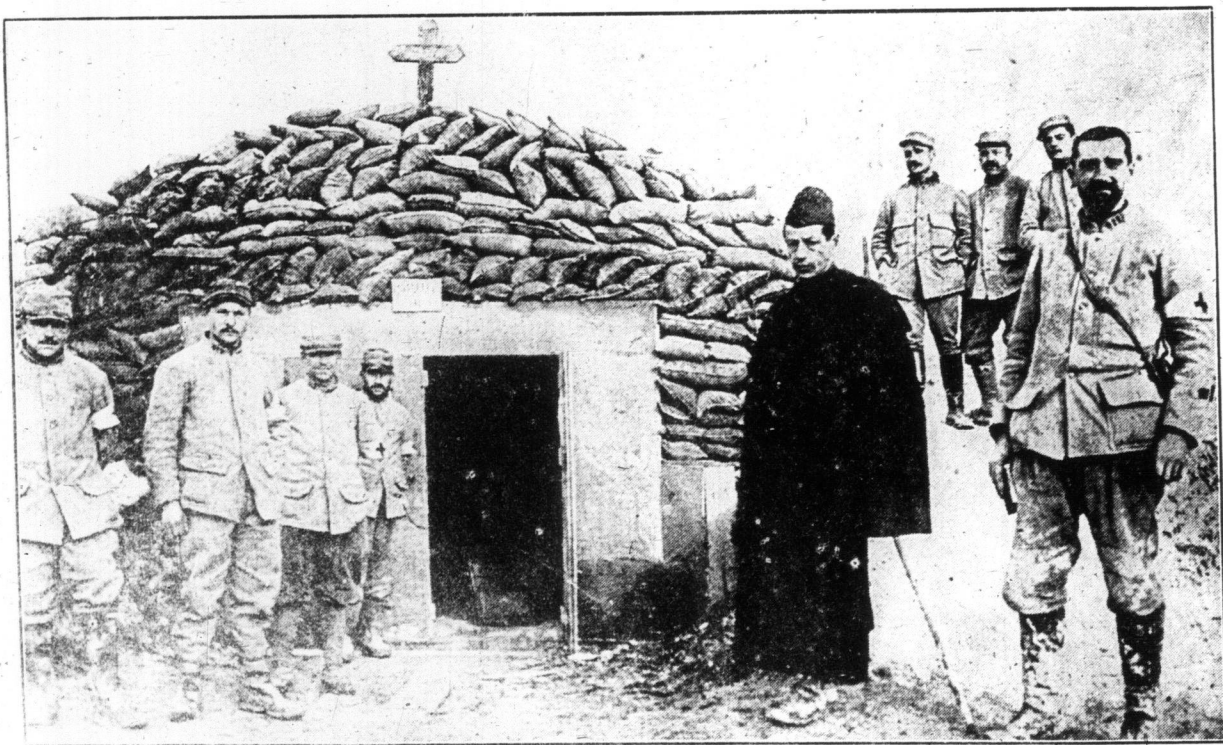
Religion and the war. A primitive sand-bag cemetery chapel in Champagne.