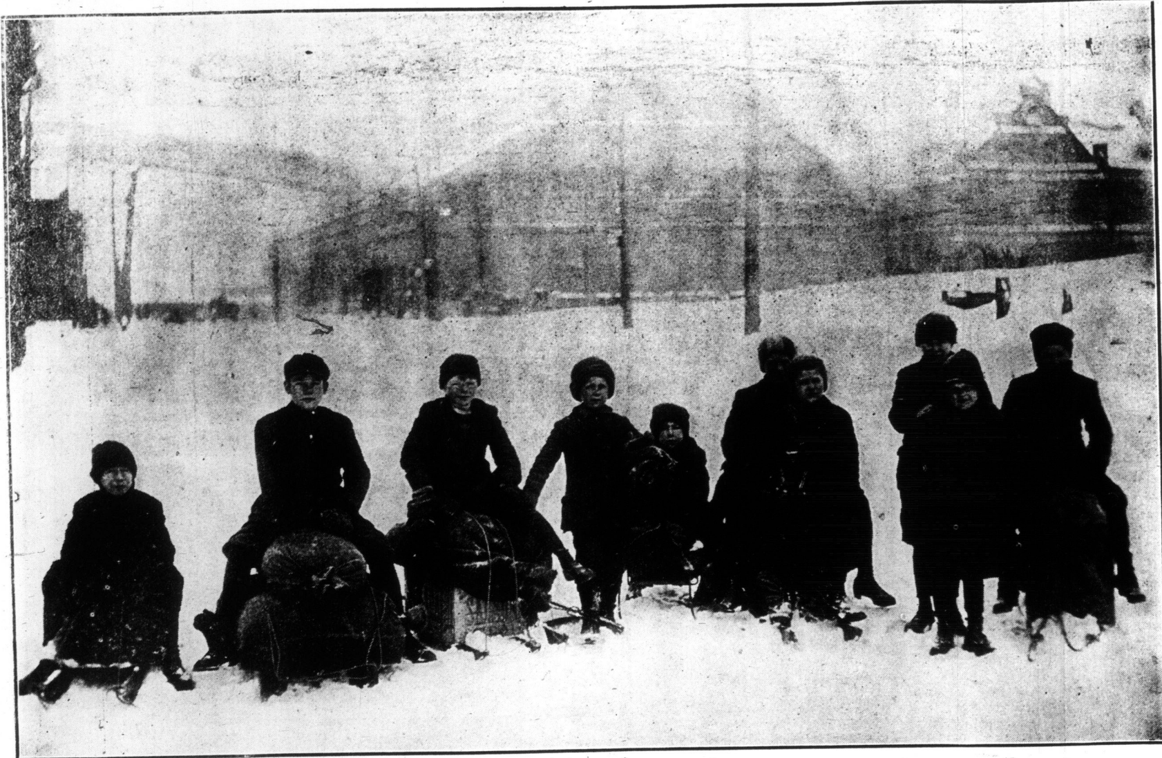
Getting their weekly supply of fuel. Pleasure sleighs are put to good use on Saturdays by the lads along Parliament street.