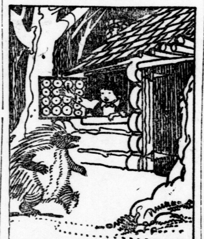
"What's your great hurry this morn- ing?" asked the King, as Chief Porky drew near.

When you have that tired, careworn look and you want to freshen up for the afternoon evening, bathing the face in the sallowite lotion will produce a wonderful transformation. You will find this more refreshing than an hour's rest.—Advt.