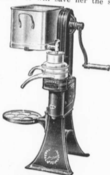
The "Standard" 12