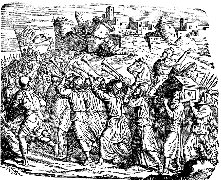
THE FALL OF JERICHO.

The plan of battle was a new one. Joshua had never heard anything like it. They were to compass the city once each day for six days, and on the seventh day they were to march around the city seven