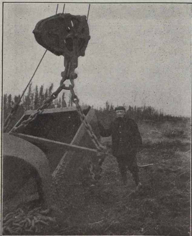
Fig. 3.—Bucyrus Drag Line Bucket.

house is located on the west bank of the river. These boat houses afford facilities for the inspection of the aqueduct. In the boat house on the east bank a blow-off pipe is provided for draining the aqueduct.