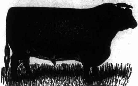
OFFERS FOR SALE