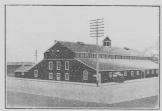
THE EXHIBITION BUILDINGS, NELSON,

Building operations, which were not vigorously pursued after the first rush of constructing the city, have been renewed and many substantial and well appointed residences have of late been erected in different parts of the city, while in the business parts the Canadian Bank of Commerce have arranged for the construction of a handsome block and the Provincial Government is putting up a large and commodious court house that will also be used for the purposes of the local government offices.