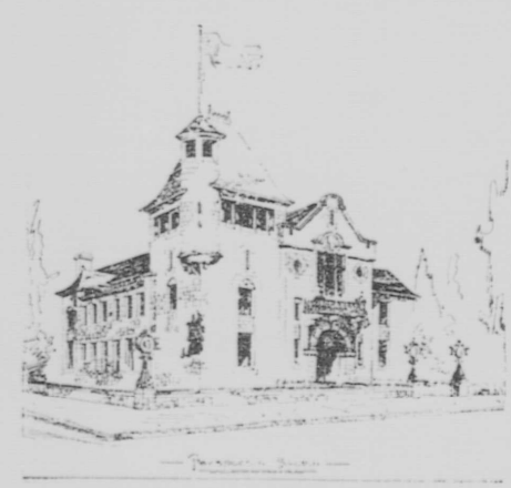
THE NEW COURT HOUSE, NELSON.

It is doubtful if anywhere in Canada can be found a more well regulated city; though the Police Staff consists of only a Chief and two subordinates, the absence of crime and the small