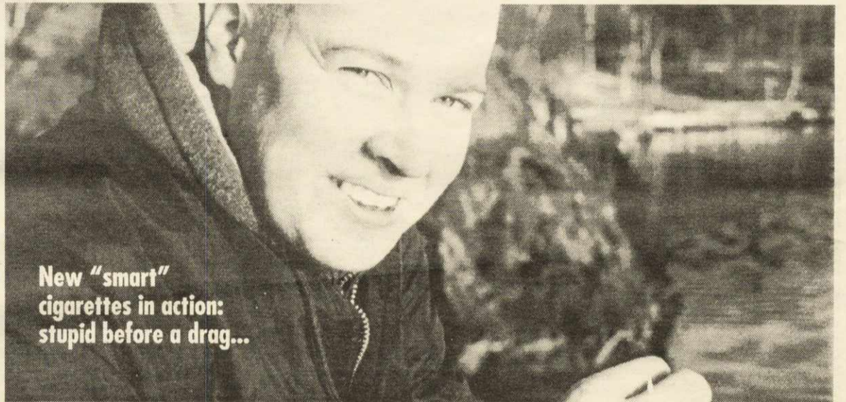
New "smart" cigarettes in action: stupid before a drag...

"It will not increase stress levels. The action of inhaling and exhaling provides for relaxation, which is conducive to retaining the knowledge they are inhaling."