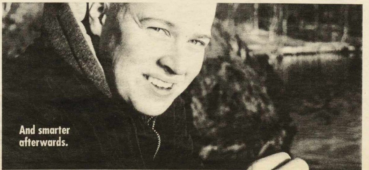
And smarter afterwards.