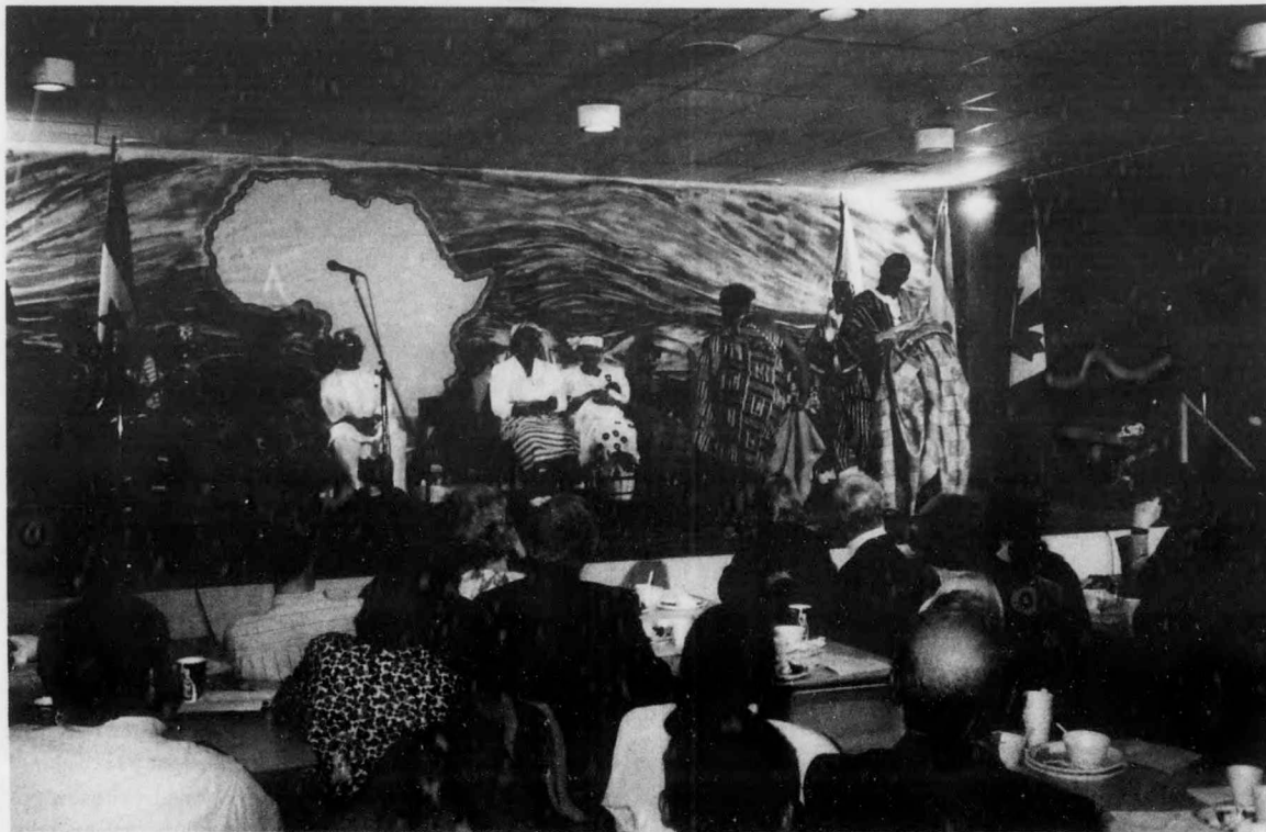
Another scene for Africa Nite '95

As the Minister of Education in Ontario observed: "For me,