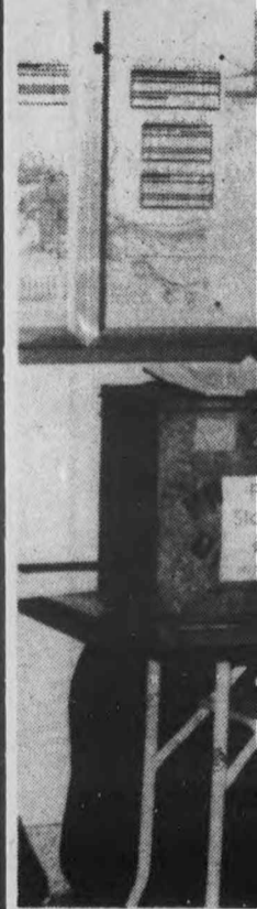
Voting: A student Union election

For further information call the Civil Engineering Office at 453-4521.