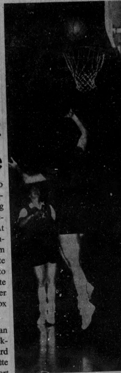
Varsity and J.V. tryouts will commence Nov. 20th at 8:30 p.m. in the Lady Beaverbrook Gym.