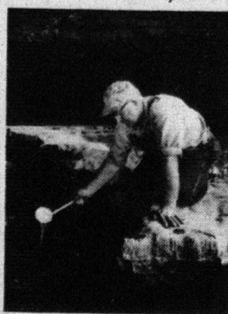
Our own iron-free water

AT THE JACK DANIEL DISTILLERY, we have everything we need to make our whiskey uncommonly smooth.