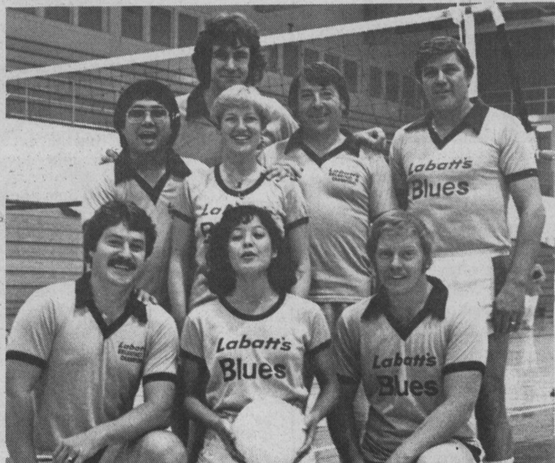
Labatts came through to win U of A volleyball media tournament. Could they have bribed Golden Bears referees that night?