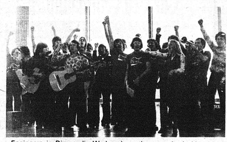
Engineers in Dinwoodie Wednesday - they may be lacking in other areas, but spirit they've got.