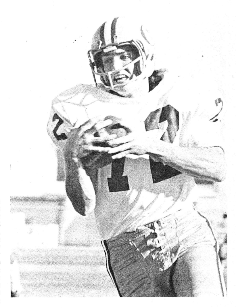
It's great to score a touchdown!