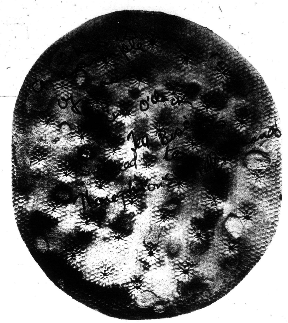
Full sized illustrations of "five o'clock tea biscuits" served to Houghton's "Hell Hounds" at Salisbury Plains. On the reverse side of the biscuit is written the names of fourteen members of the Machine Gun Section of the Canadian Overseas Force.