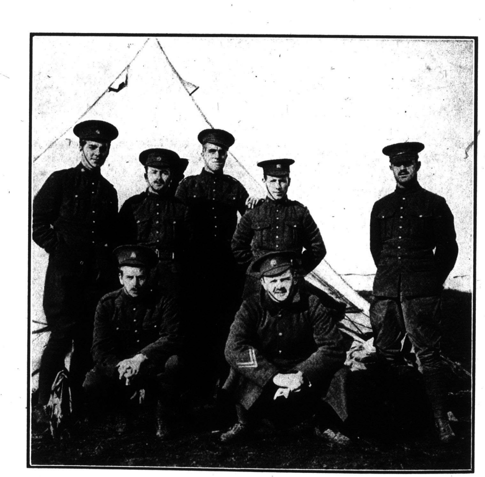
Members of Houghton's (Canadians) Machine Gun Corps at Salisbury Plains,