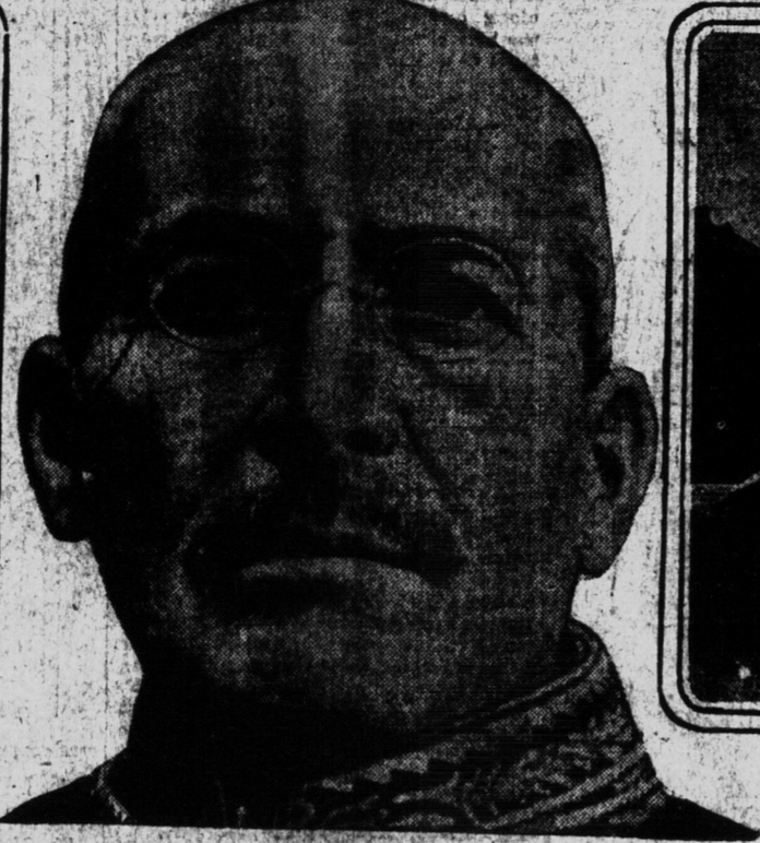
GENERAL VICTORIANO HUERTA