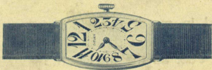
This new Rectangular ribbon wrist watch will be the choice of hundreds of discriminating women. Its simplicity but adds to its beauty. And its dependability is assured by its movement—made by the Gruen Watchmakers Guild