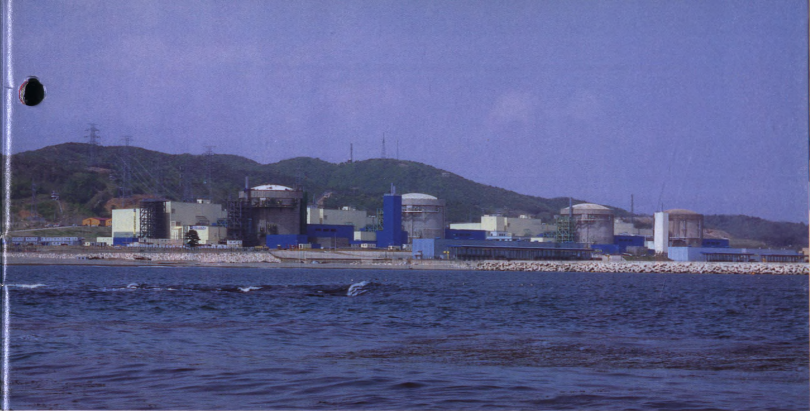
Four AECL-designed CANDU 6s at the Wolsong site, Korea. Wolsong 1 was the top-performing reactor in the world in 1997.

extensive experience in the design, construction and safe operation of both research reactors and CANDU power reactors worldwide.