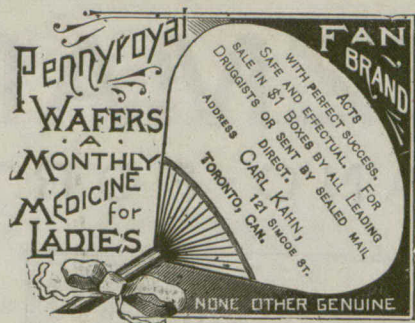
Mention the Ladies' Pictorial Weekly. 19-10in

Lady Agents Wanted. 18-13in Mention the Ladies' Pictorial Weekly.