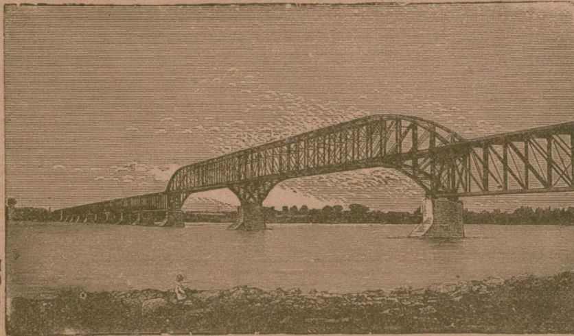
ST. LAWRENCE RIVER BRIDGE, CANADIAN PACIFIC RAILWAY, LACHINE, P. Q.

Railways and Highways Iron Bridges, Turntables Iron Piers and Trestles Bridge Rods Right and Left Hand Sleeve Nuts and all kinds of Structural Iron Work.