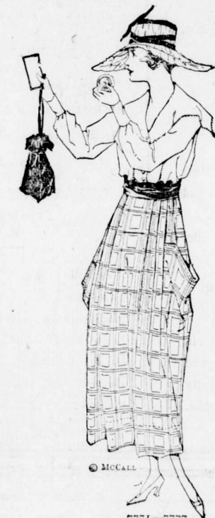
A White Organdy Waist is Smart With a Plaid Skirt

Plaids are lovely for sport skirts and for other kinds of skirts too.