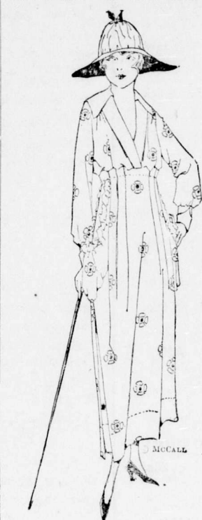
Invitingly cool is a Flowered Voile Frock with Soft Pleats and Puffed Pockets.

with dark tan wool jersey in others. This combination of silk and wool jersey is frequently used by the best dressmakers. In some loose-fitting