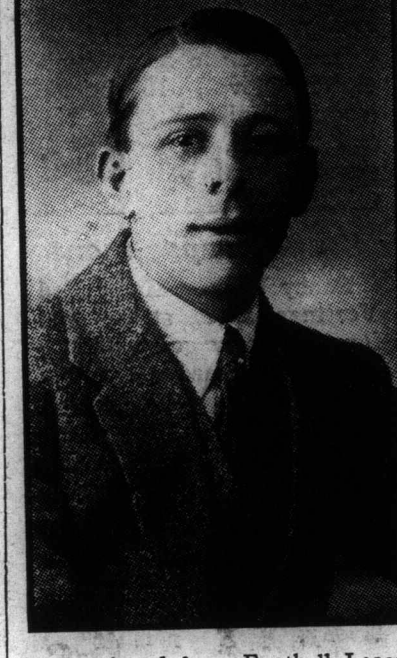
Who resigned from Football League