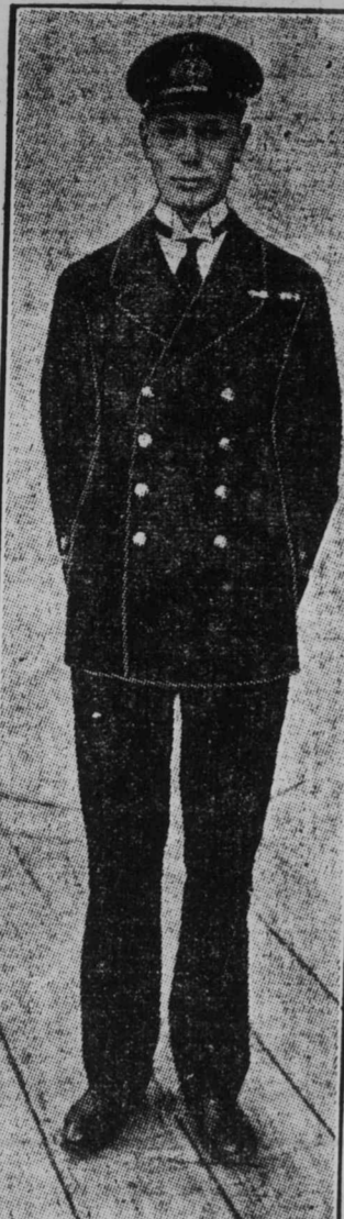
Sub-Lieut. H.R.H. Prince Albert