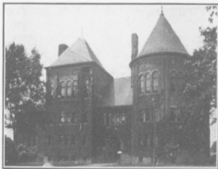
Central School at Chatham.

Chatham is widely known for its excellent public schools. The Central school is the largest public school in Ontario, outside of Toronto. McKeeugh School,