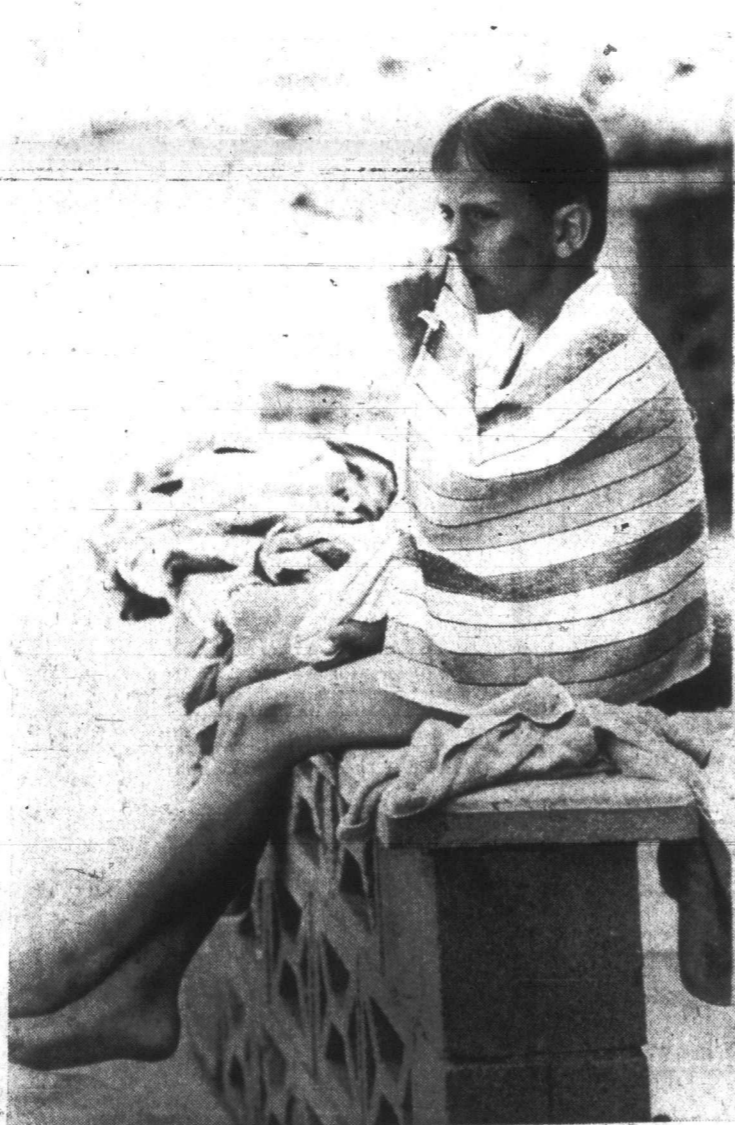
A pensive little lady