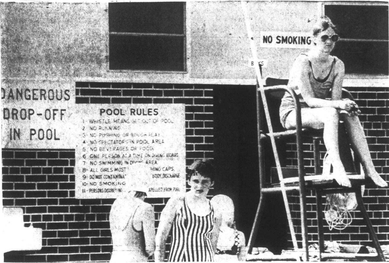
Pool rules and regulations

Swimming pools in the Port Credit-Mississauga area have been a hive of activity, especially since the end of school, as young people head for the cool water to beat the heat.