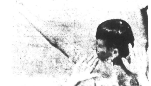
A high dive . . . . . . from a low board