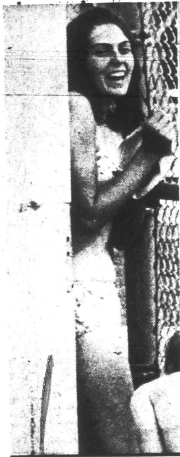
A coy cutie