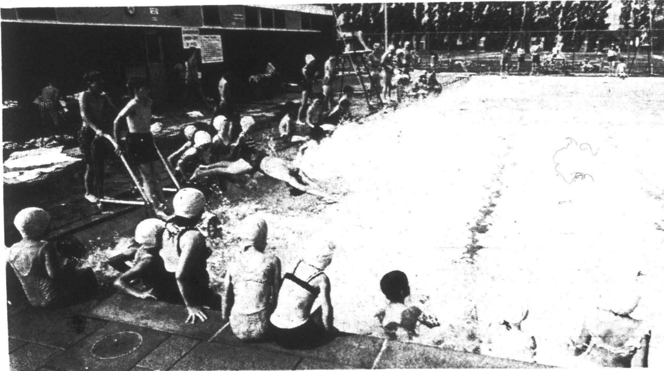
Swimming's a splash