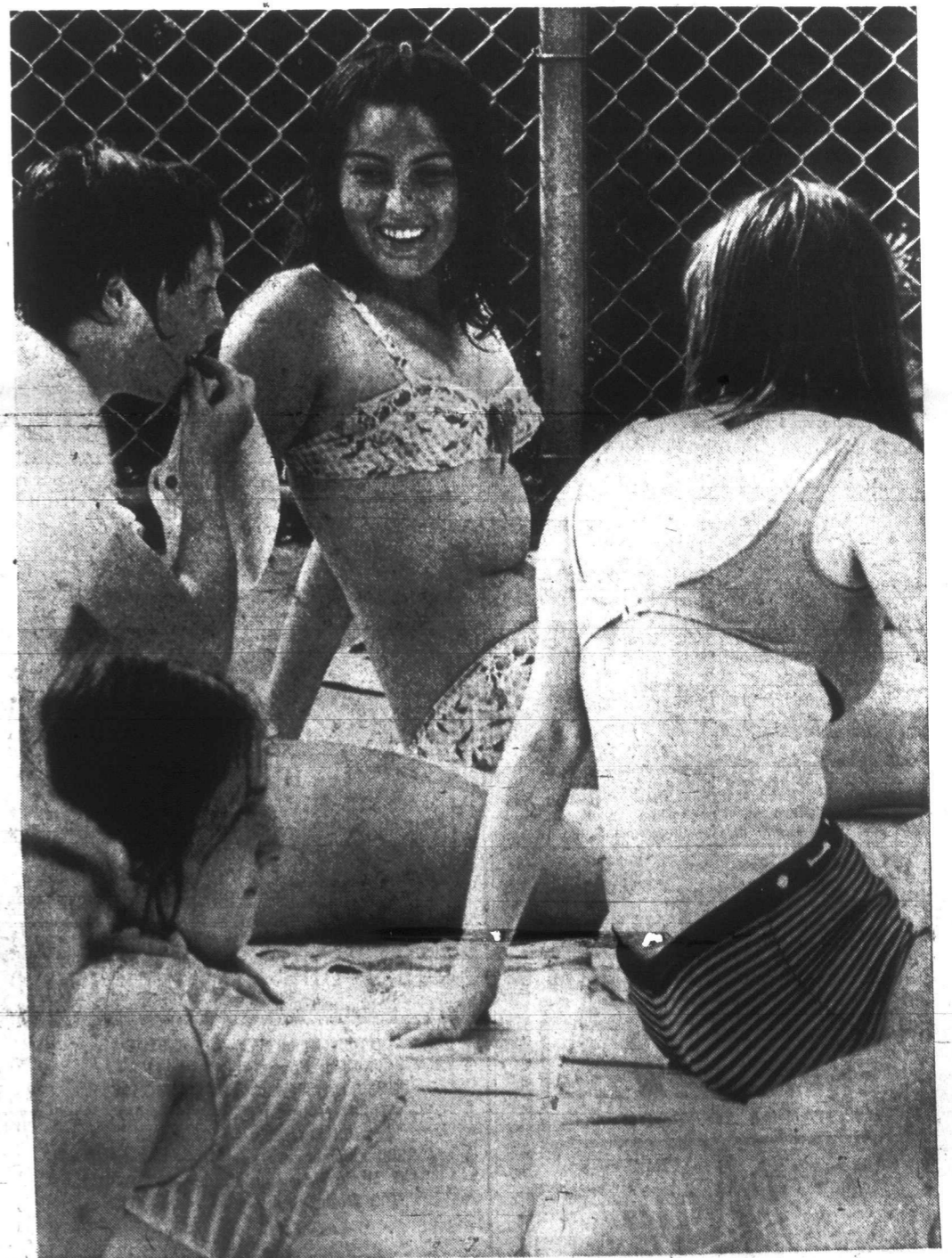
Why the boys swim