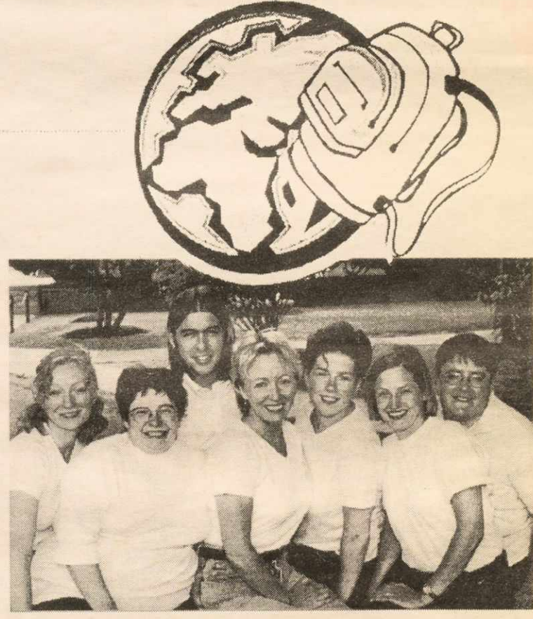
The CUTS staff are here to help you plan your next trip!

Once you've settled, drop by your local Travel CUTS office to check out the amazing travel deals and meet our friendly, knowledgeable staff. See you soon!