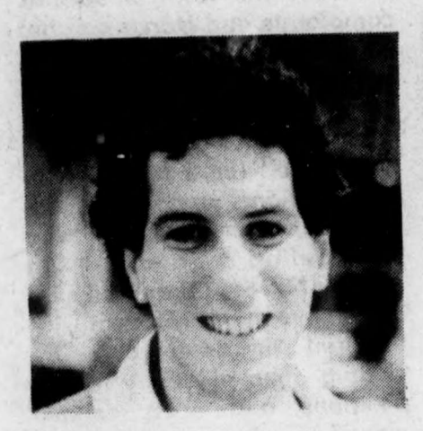
Only when I'm sober.

Do you think there is an alcohol problem on campus? If so, what do you think should be done about it?