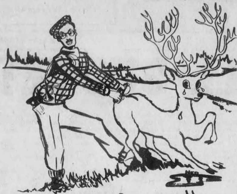
Biggest Buck I ever saw!!

Hunting is an activity that has had a long and varied history. In present days, the activity has divided into a great many different branches.