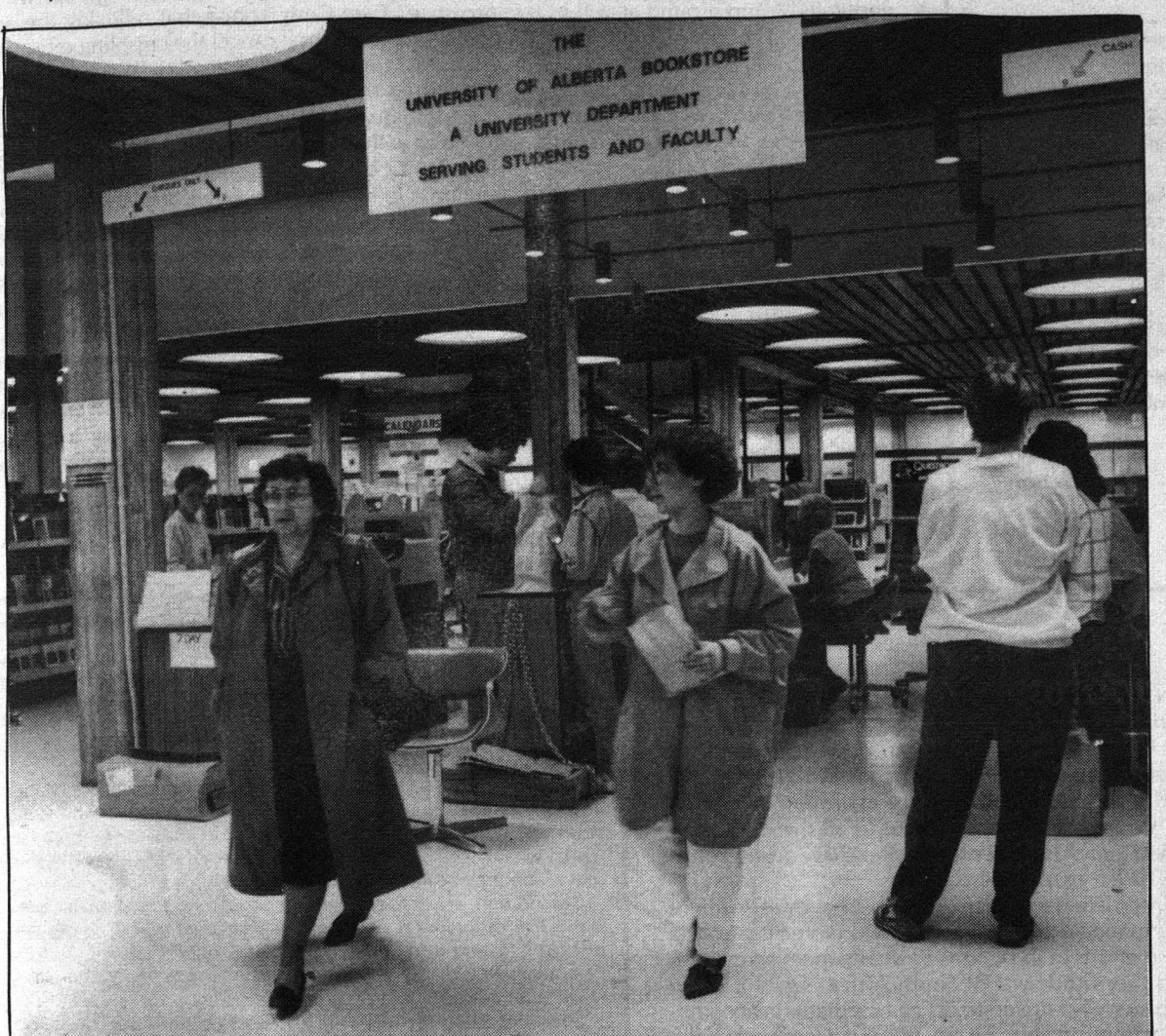
U of A bookstore patrons: leave your cash at the door.

The Bookstore will report any progress in this area to the Board of Governors at their next meeting October 10.