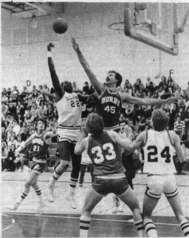
A jump for the ball looks like a tie from here.