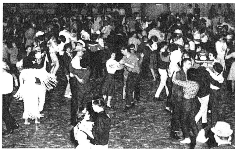
SWINGIN' AND SWEATIN' —Dances for squares and squares for dances, polkas and the Chwyll Bros. Orchestra marked Bar None, the barn dance par excellence.