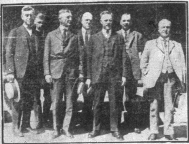
LEGISLATURE COMMITTEE REPORTING ON ONTARIO HOTELS.