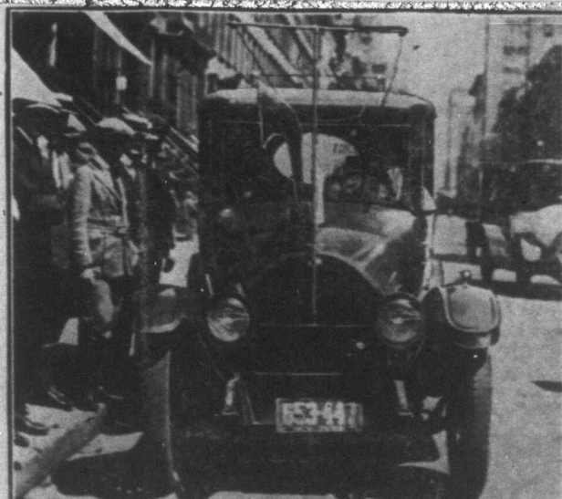
Cars equipped with radio are becoming frequent in American streets.