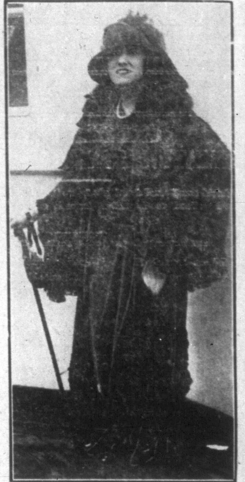
Gloria Swanson as she looked when she arrived in New York recently straight from Paris.