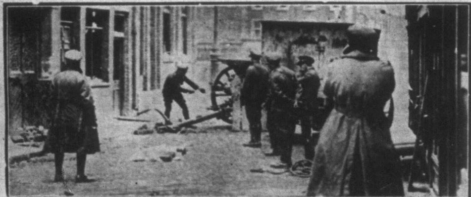
A field gun in action in the streets of Dublin during the recent fighting.