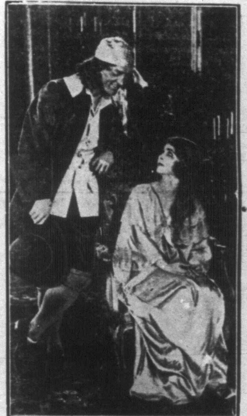
Georges Carpentier is now a movie actor. Here he is in his new role.