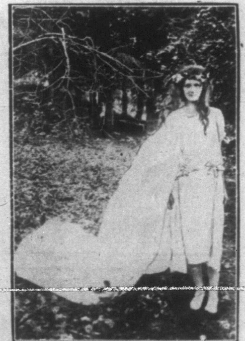
A Grecian Study.