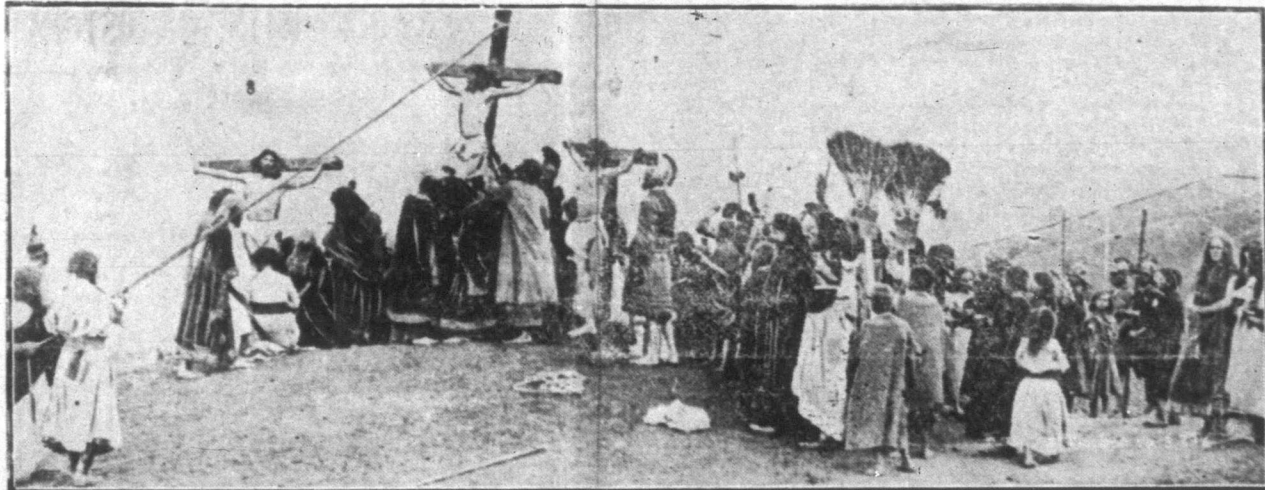
A rival of Oberammergau—Passion Play produced in Mikofalva, village in Hungary.