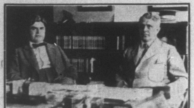
John L. Lewis, president of United Mine Workers and U.S. Secretary of Labor Davis conferring on the coal strike.