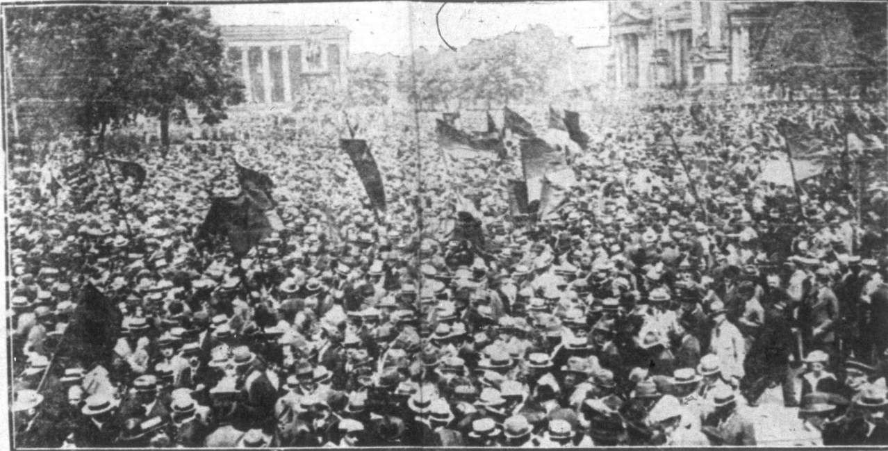
Demonstration by workmen in the Lustgarten, Berlin, against the murder of Rathenau.