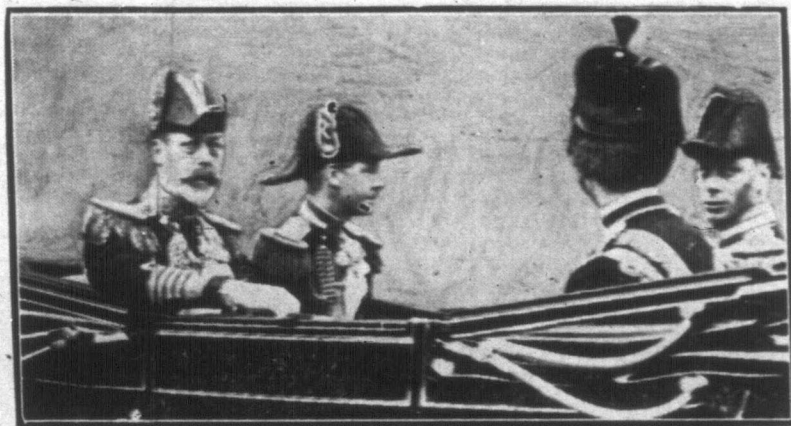
Home again! The Prince of Wales with the King and his two brothers riding through London.