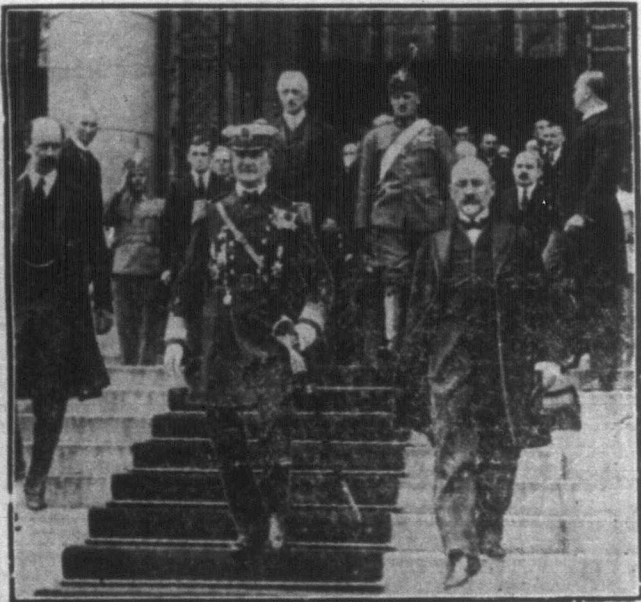
Admiral Horthy, regent of Hungary, after opening the new national assembly.