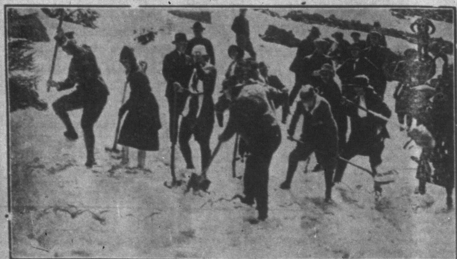
Snow shoveling in June in Banier National Park, American Rockies.