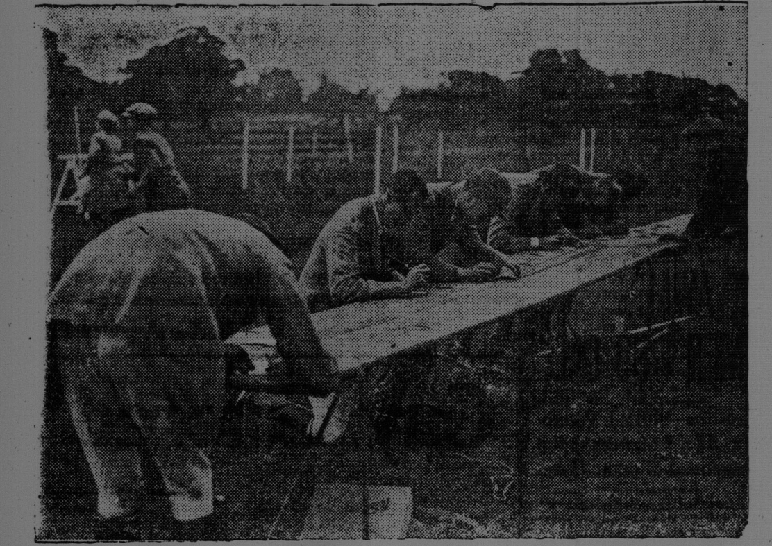
This picture doesn't look like a race, but it is. These competitors are taking part in a "Conundrum Race" at Pony Gymkhana in England. They were required to dismount and solve a conundrum in writing, the lady partner taking the answer and riding to the winning post.