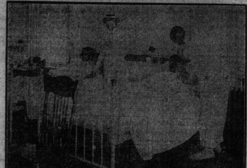
Doctor and nurse around among the sick patients ministering to their needs.

"I had no idea there was any institution in Canada so perfectly organized, so admirably staffed, and so efficiently and economically carried on."—One of the seven of the Provincial Medical Health Officers of Ontario who recently visited the Muskoka Free Hospital for Consumptives.