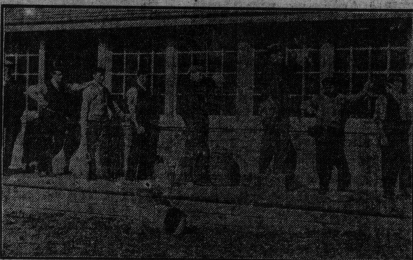
"Up"—patients taking exercise and at same time helping the hospital.