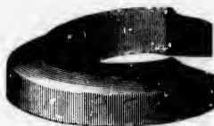
Size for 3-4 In. R. R. Track Bolt.