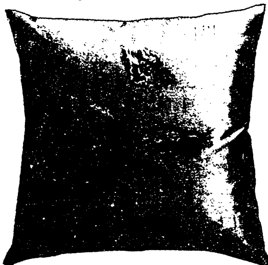
No. 2219. SOFA PILLOW DESIGN.

is durable enough to stand the wear that the small child gives its clothes. Only four stitches are used: the Cross, the Plain Russian, the Buttonholed Bar, and the Sorrento Wheel. It is one of those satisfactory pieces of work in which one may note her rapid progress and take courage therefrom.