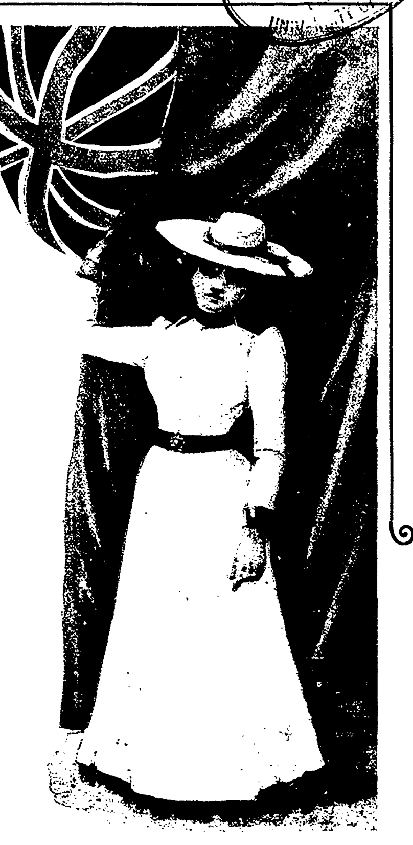
Confederation Life Building Toronto